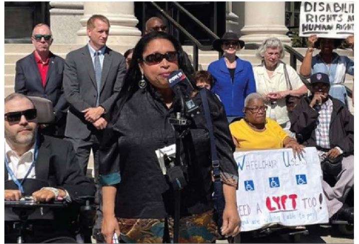
A group of people stand outside White Plains Court with protest signs about Lyft

Back in August I went to White Plains court watching for the Lyft Discrimination case against us people with disabilities. Court watching is to see what's going on and see how the case is going. The law firm is called Finkelstein, Blankinship, Frei-Pearson, and Garber LLP law firm. They're the ones who are doing a good job representing us people with disabilities to make sure we don't get discriminated against by the private cab company called Lyft. I'm not blaming the drivers, I'm blaming the head of the company. I found out about this through BCID—Brooklyn Center for the Disabled.